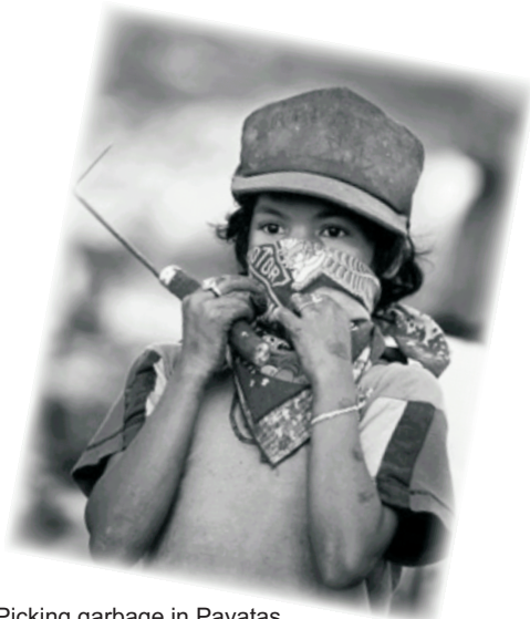
Picking garbage in Payatas

When you look at your city what do you see? Many of us focus on the new developments, the condos, malls, and businesses. A few have eyes to see in back of these developments, to the squatter communities, the homeless, the unemployed, and the street children at risk of repeating the difficult lives of their parents in grinding poverty. So much of seminary education is upwardly mobile. The ATS Transformational Urban Leadership program sharpens the concepts, attitudes and skills needed to uplift poor communities both spiritually and materially. This brochure is your invitation to join a community of scholar-practitioners serious about bringing the Gospel of the Kingdom to the poor.