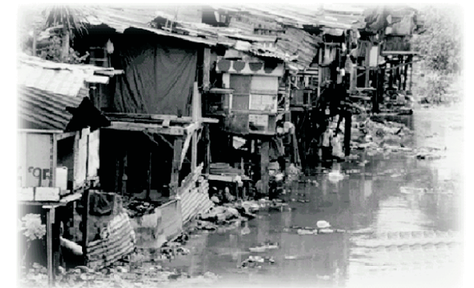
Plant a church here