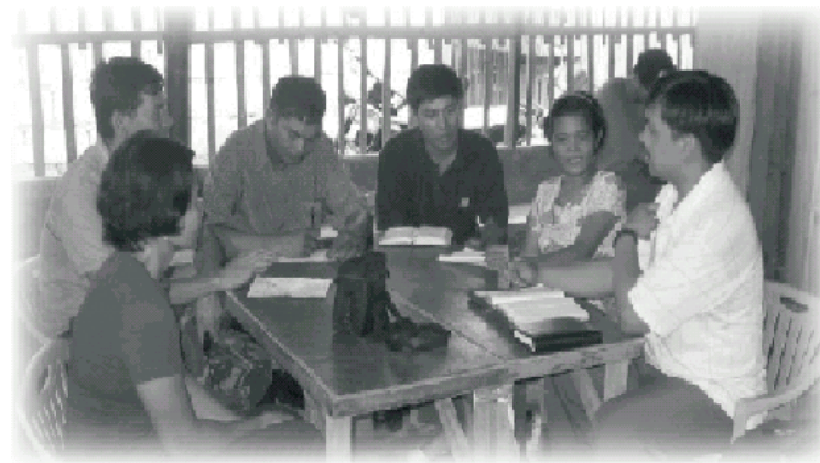
Urban poor church planting team strategizing